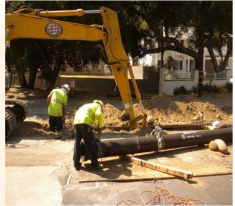
NCWD Construction Crew on Wildwood Canyon, Newhall